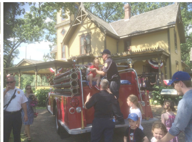
The Ice Cream Social at the Burwell House on June 25th. Minnetonka firemen give children a ride and a suggestion board was set up for new ideas for the City of Minnetonka.