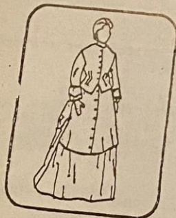
Day Dress with Polonaise 1870's

Store Hours M-F 9:00 am to 4:30 pm Sat. & Sun. 1-4:30