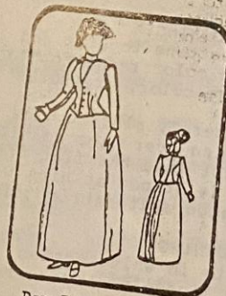
Day Dress 1880's

Patterns are $7.50 each plus 38¢ for tax 75¢ for postage Total amount is $8.63.