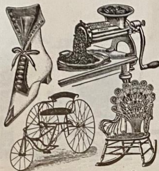
MONTGOMERY WARD AND COMPANY'S CATALOGUE, SPRING-SUMMER, 1895